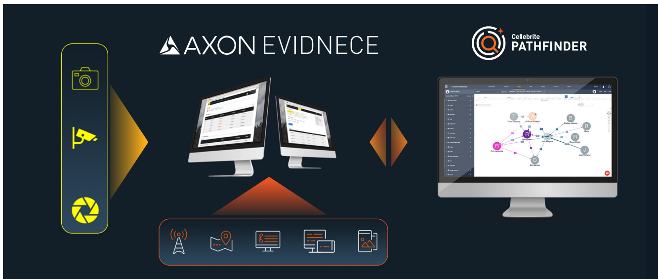
Figure 1. The Axon and Cellebrite partnership enables investigators to combine relevant digital evidence from multiple sources related to a case or project into one repository: Axon Evidence, Evidence.com.

Following is a closer look at Axon and Cellebrite’s solutions, the value of bringing advanced analytics capabilities into the investigative workflow, and how the Axon-Cellebrite integration works.